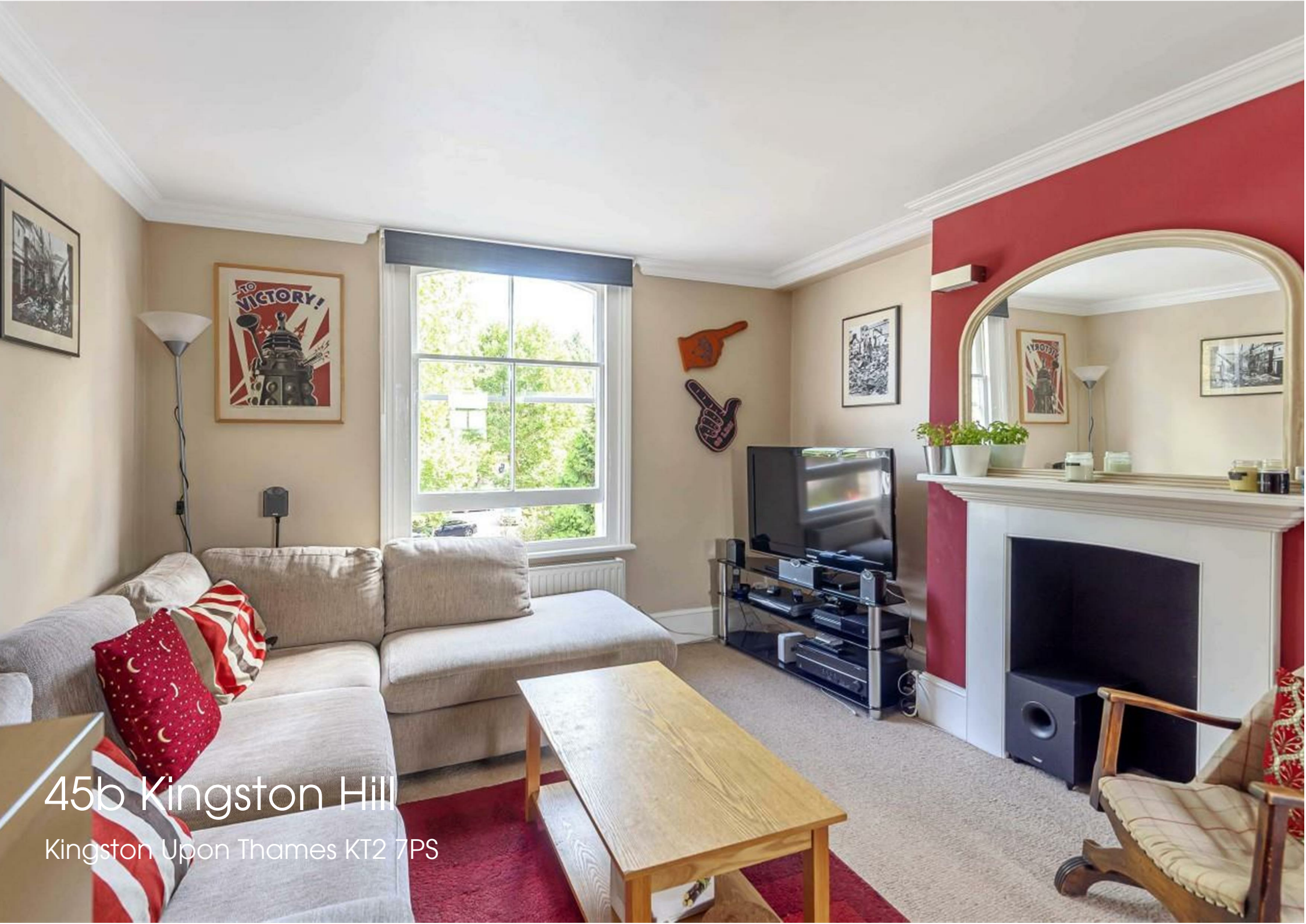
45b Kingston Hill Kingston Upon Thames KT2 7PS

34 Richmond Road Kingston upon Thames Surrey KT2 5ED www.gibsonlane.co.uk Tel: 020 8546 5444